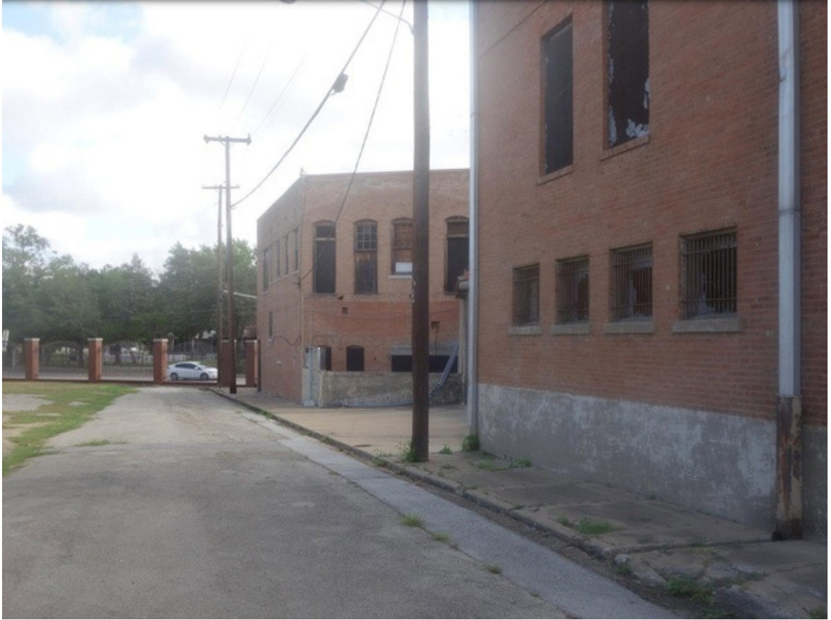
The MAC Cedars complex will encompass five buildings.