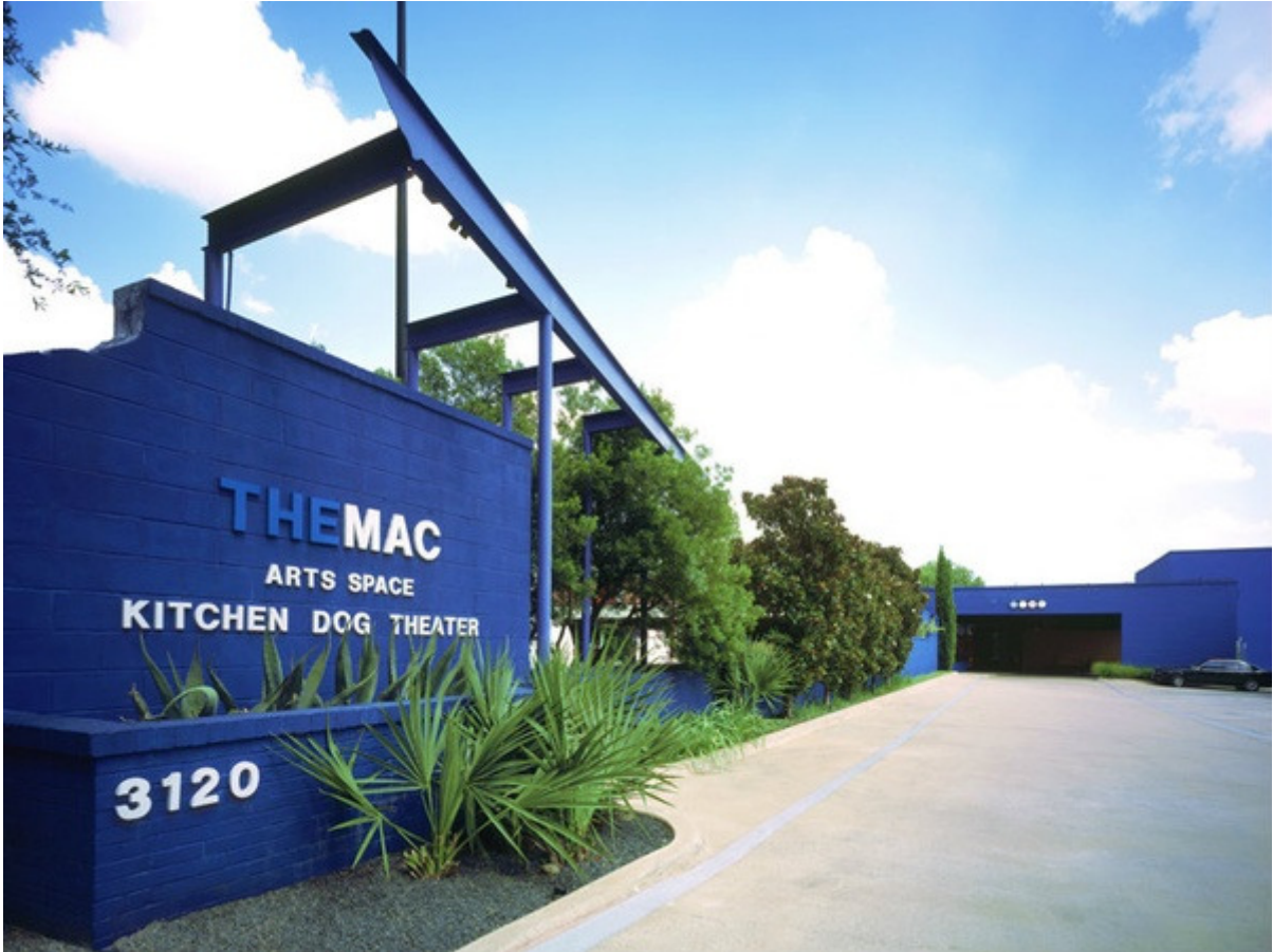
The current location of the McKinney Avenue Contemporary.

In a move that further solidifies the Cedars' status as the city's newest artistic hub, McKinney Avenue Contemporary will relocate from its namesake location to a new venue at 1601 S. Ervay St. in early 2016. That new address is within walking distance to the DART Cedars station and South Side on Lamar.