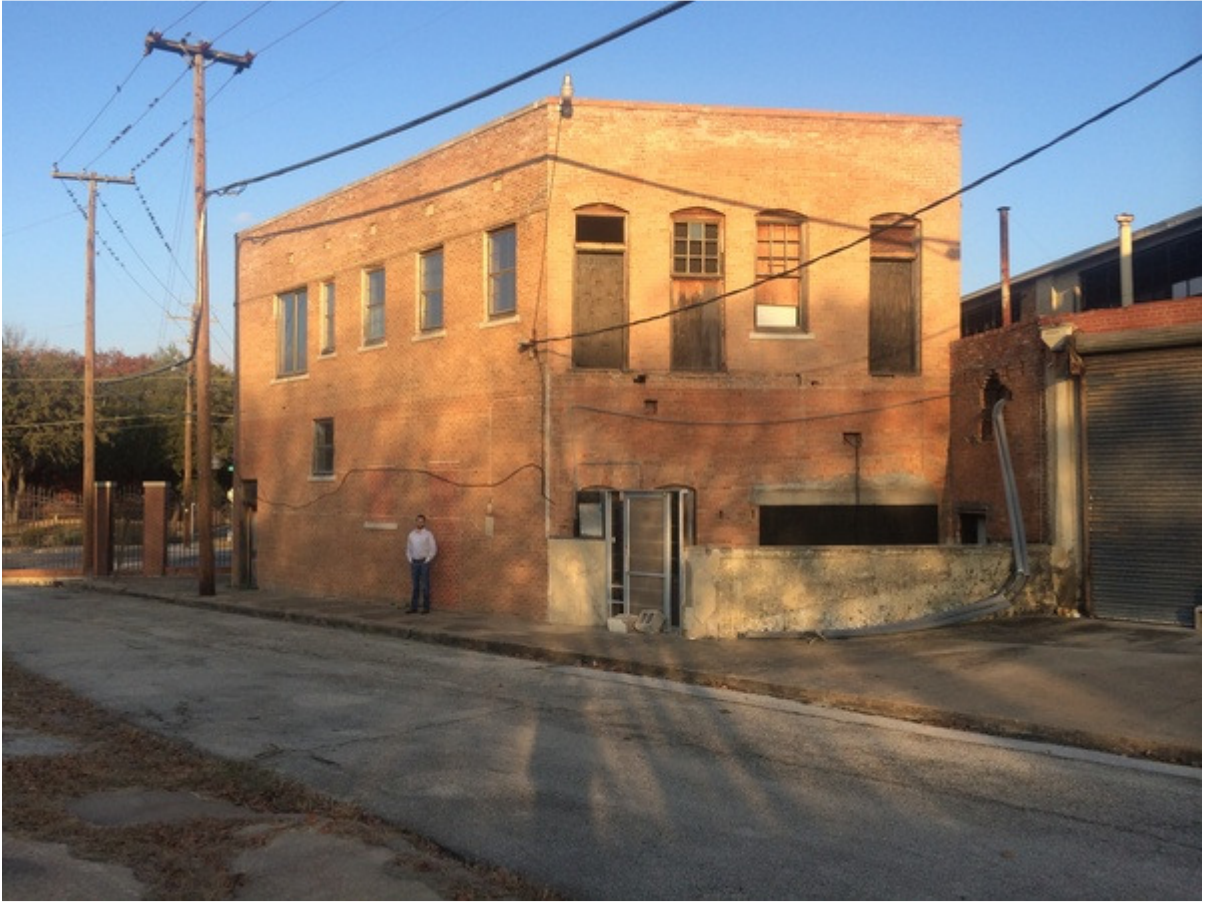
The MAC will relocate to the Cedars neighborhood in spring 2016.