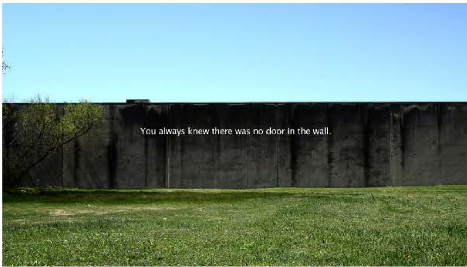
K. Yoland, Letters without an address , 2016, video still.

The MAC in Collaboration with The Reading Room Invites Viewers on a Multimedia Journey Through Dallas' Southern Sector with Two Exhibitions by K. Yoland Letters without an address at The MAC Opening Reception Saturday, May 7, 7-10 p.m. and Hidden Histories at The Reading Room Opening reception Saturday, May 7, 6-9 p.m.